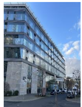
Fig. 2: Englische Str.