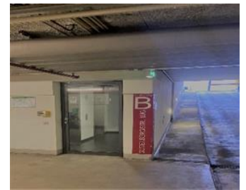
Fig. 7: Elevator