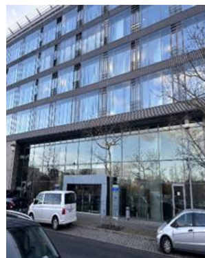
Fig. 1: Office building

Take the S3 or S9 (S Spandau BHF), S5 (S Westkreuz) or S7 (S Potsdam Hauptbahnhof) and after four minutes exit at “Tiergarten”. From there on it will be a 10-minute walk: Take the exit and walk north on “Bachstr.” and cross the street. Turn right onto “Wegelystr.” and then turn left onto “Englische Str.”. Turn right again and you will be on “Gutenbergstr.”. You will now find the Berlin avodaq office on your left. You can use figure 1 and 2 for further orientation.