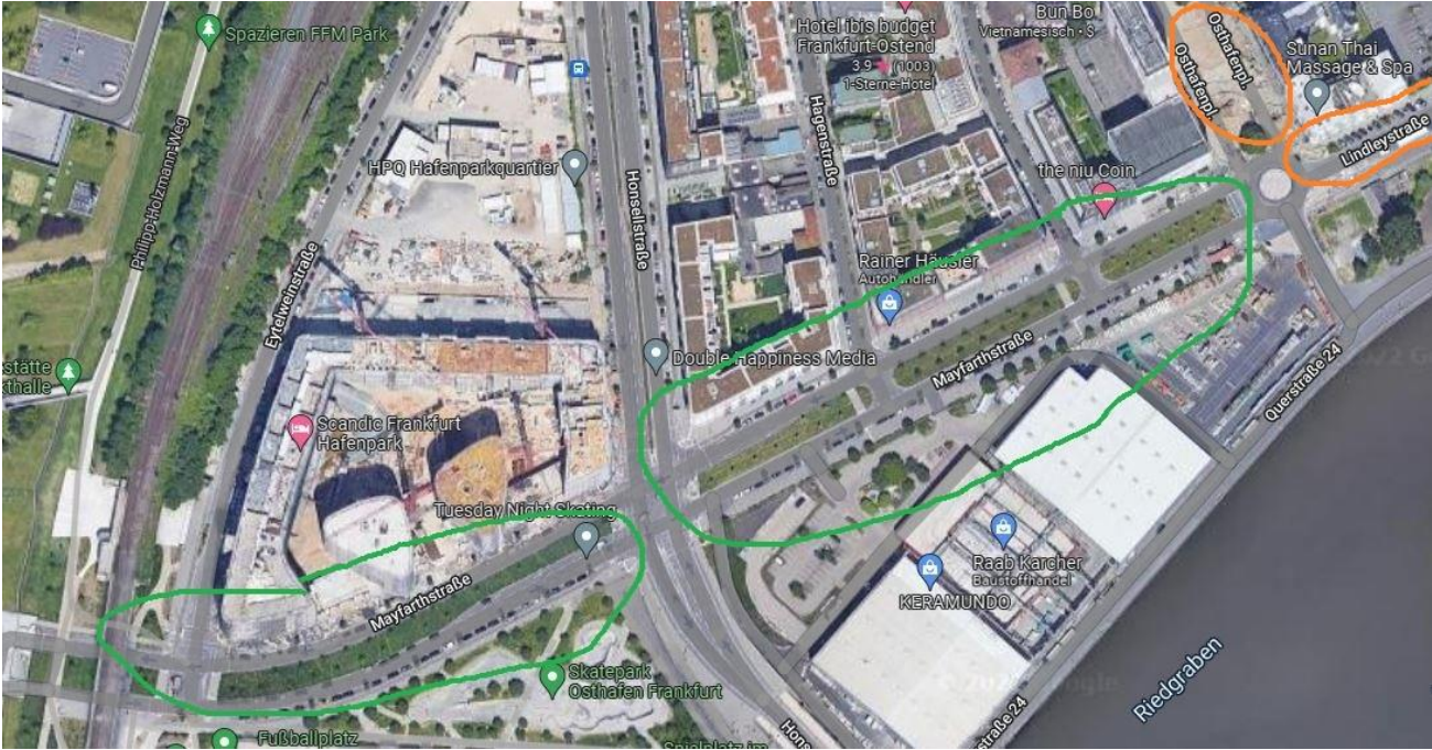
Figure 3: Alternative parking spaces